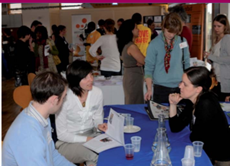
Big Link Up event, Wetlands Centre, March 2011.